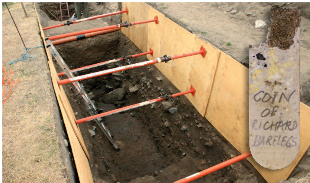
Bamburgh: Trench 8 re-evaluation with shoring

We have amalgamated the artefactual assemblages from the Hope-Taylor and BRP excavations into one contemporary archive. We are evaluating and analysing the metal-work, pottery, and the small lithic and glass assemblages from Trench 8, and now have five radiocarbon dates for key stratigraphic horizons. Together with the worked bone, animal bone and paleoenvironmental assemblages, these will allow the BRP to write up the Hope-Taylor and BRP Trench 8 excavations as one in the Spring of 2018.