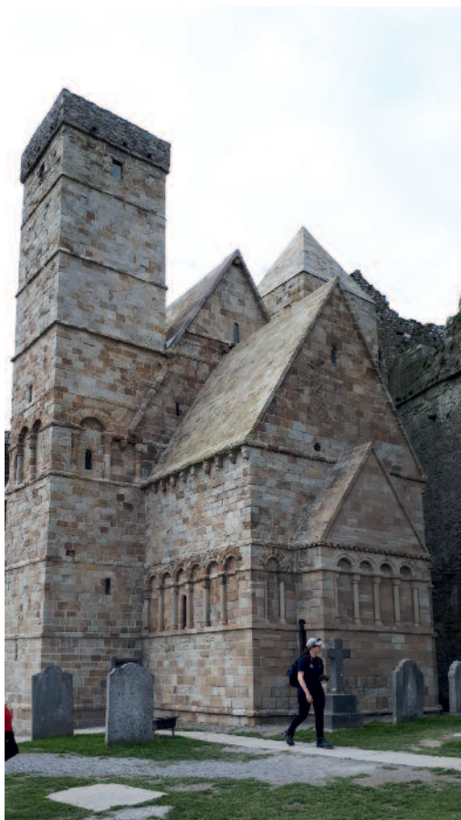
Cormac's Chapel at Cashel (A. Williams)

Outside is a replica of the twelfth-century St Patrick's Cross – the original being on display indoors in the adjacent refurbished Vicar's Choral hall. It is unusual in not having a ring around the