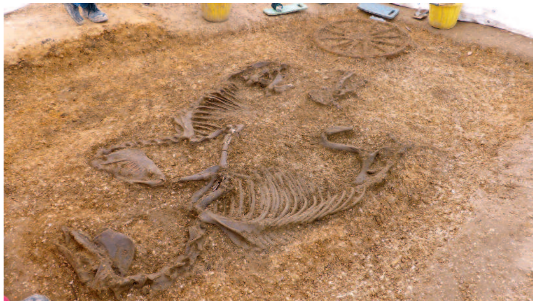
Pocklington Chariot burial (P.Halkon)

Current Archaeology Live! 2019 will be held in February 2019, with further details available at https://www.archaeology.co.uk/vote