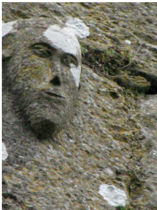
The face on the McCarthy castle (WH)

If the friary is evidence of the McCarthy clan's piety, then the castle was their secular stronghold. The site is private land and heavily overgrown. The castle was built at the same period as the friary and was a tower house with adjoining bawn or walled enclosure. There were a number of defensive features: a moat, corner towers on the bawn and evidence of a yett on the main entrance. This was a hinged iron grill which could be swung over the main door to protect it from battering and impede efforts to set it on fire. A face carved in stone high up on the tower still suggests that strangers are being watched.