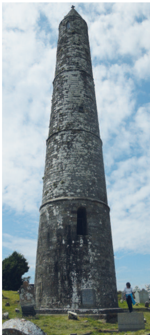
Ardmore, the tower (M. Nieke)

stops of the week, this ruined church (known as the Cathedral), built in the twelfth century, is sited on an, arguably, semi-circular platform, overlooking Ardmore village with views along the coast. The church, despite its sixth-century ogham stones and Romanesque blind arcading on an external wall, is overshadowed by the twelfth-century Round Tower, unusually rising in tiers, to 30m in height. St Declan is said to have founded a monastery here in the sixth century, introducing Christianity to the area. A humble oratory, said to be his burial place, is tucked into the corner of the