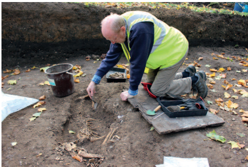
Fulham Palace: excavating the canine

discovery was the skeletal remains of a large canine.