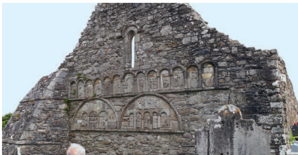
Ardmore, medieval sculpture in the blind arcading (A. Williams)

For lunch, we stopped in Ardmore, a popular seaside village with a mile-long sweep of beach – an opportunity for a paddle. Back in the coach up steep, narrow, winding roads for Ardmore church and Round Tower. Voted one of the favourite