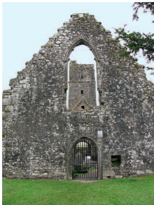
Kilcrea Friary (W. Husband)