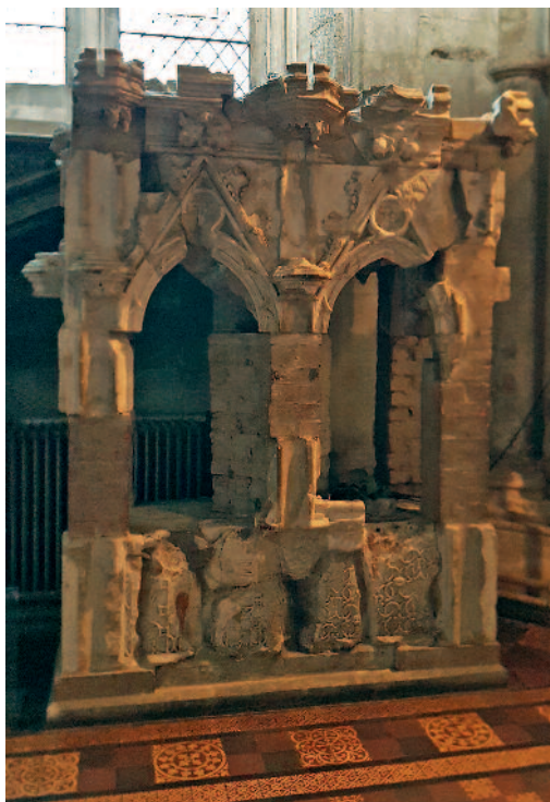
St Albans, shrine of 'St Amphibalus'