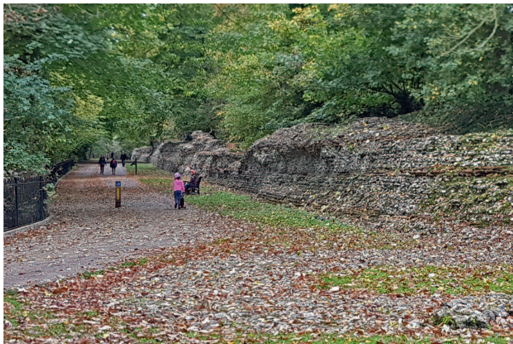
By the London Gate, where Watling Street enters Verulamium, the outer ditch at left