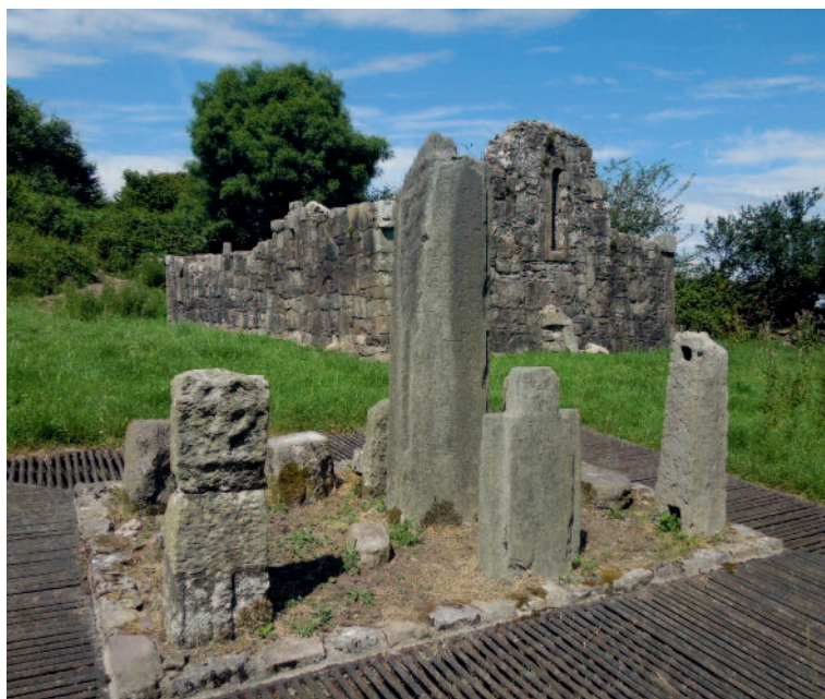
Toureen Peakaun: fragments of the high cross with chapel beyond

At Toureen Peakaun we visited a remarkable site retaining a small church dating to around 1100. This marks the site of a seventh-century monastic site established by St Abban on royal land and named after St Beccan – an Irish ascetic who died in 689. An important collection of decorated Romanesque and earlier carved stones remains, including cross shafts, with fragments of a high cross which has mortice and tenon fittings in a skeuomorph copying timber, possibly the earliest surviving high cross in Britain or Ireland. Also present are rare early shrine-post corners – perhaps indicative of a stone and timber-built reliquary shrine and a sundial – one of only twelve known in Ireland. At least 80 seventh- to eighth-century name stones with a mixture of Irish and Latin names are known; several were found during Tomas’s recent excavations. The names include Cummene and Laidcem, ecclesiastics known to