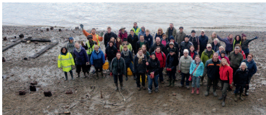
FROGs and TaDPoles at Greenwich

Early bird ticket links will be provided to TDP volunteers (the FROG) and RAI members before tickets go public. Date of ticket releases to be confirmed.