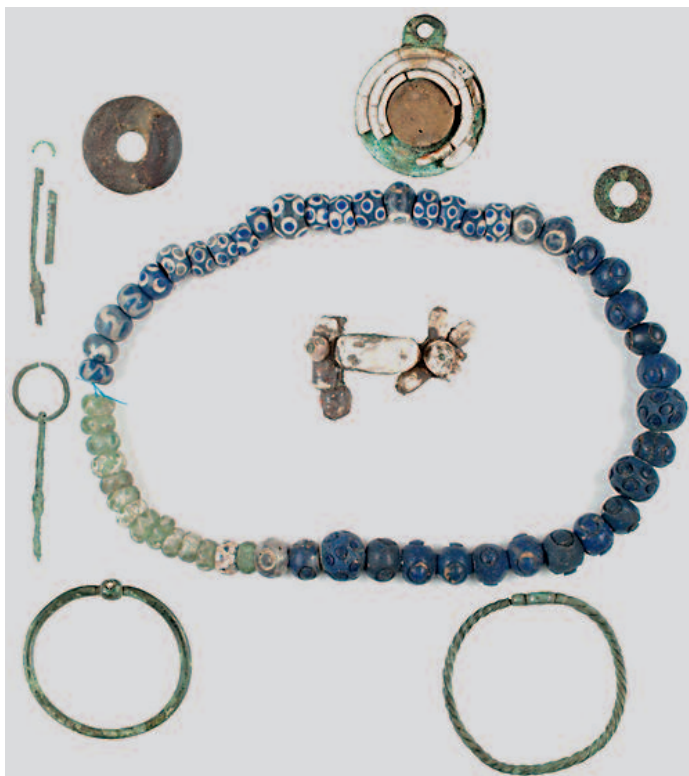
Middle Iron-Age finds from Queen's Barrow, Arras

in the conference, such as the collection from the Queen's Barrow from the original Arras excavations. Being able to see such well-known objects on the opening night, then hear about new research in the area certainly brought on a mood of excitement for the future from the delegates.